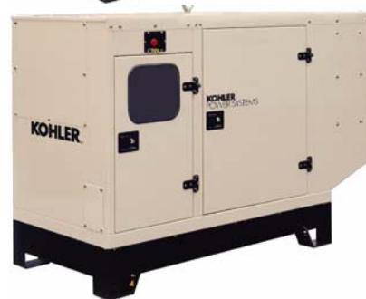
With Available Enclosure Accessory

RATINGS: All three-phase units are rated at 0.8 power factor. See TIB-109 for generator set derate tables. Obtain the technical information bulletin (TIB-101) on ratings guidelines for the complete ratings definitions.