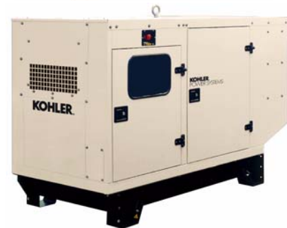
With Available Enclosure Accessory