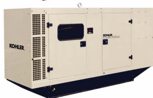
With Available Enclosure Accessory