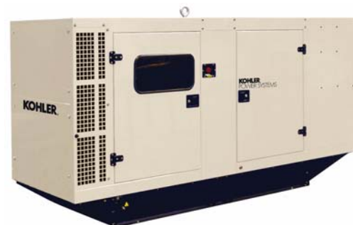
With Available Enclosure Accessory

RATINGS: All three-phase units are rated at 0.8 power factor. See TIB-109 for generator set derate tables. Obtain the technical information bulletin (TIB-101) on ratings guidelines for the complete ratings definitions.