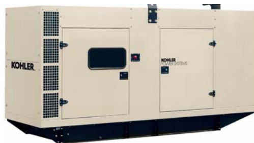
With Available Enclosure Accessory