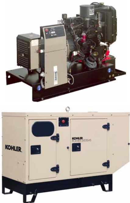
With Available Enclosure Accessory (Note: Photo depicts the M126 enclosure)