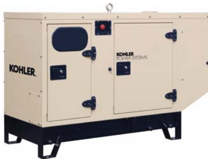
With Available Enclosure Accessory (Note: Photo depicts the M126 enclosure)