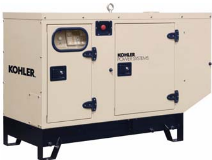
With Available Enclosure Accessory