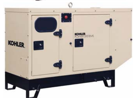
With Available Enclosure Accessory