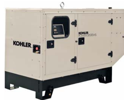
With Available Enclosure Accessory